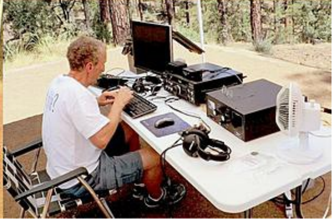
Field Day and Club Picnic Scenes, June 2015 -13- Yavapai Signal August 2015