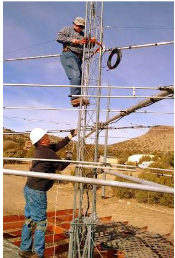
Installing VHF/UHF Antennas at the QTH of AI1KL