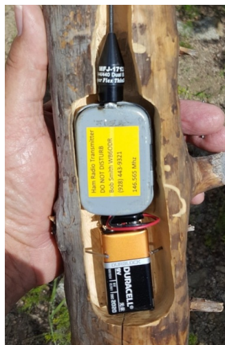
Smaller TX mounted in log