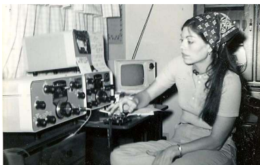
WB9SDR (SK) in 1977

The trouble with this is there is no repeater-side fix for this except disabling the repeater timeout! This "fix" also only works if the stuck microphone/PTT is not broadcasting a loud signal that would interfere with voice communications. It seems like it would be a good idea to remind all HAMs to enable a broadcast timeout on all their radio rigs, at least for repeater frequencies. This way a stuck mic would not interfere with repeater use - and this seems especially important for public service events that YARC and other clubs support. Even moreso is this important for big, linked repeater systems!! (Rimlink, etc.) Question: Shouldn't we be encouraging all HAMs to set their radio timeouts, given the importance of local repeaters and lack of some other "fix?" Trick question: Can discussions between local HAMs get someone to admit they had (and fixed) the stuck microphone?