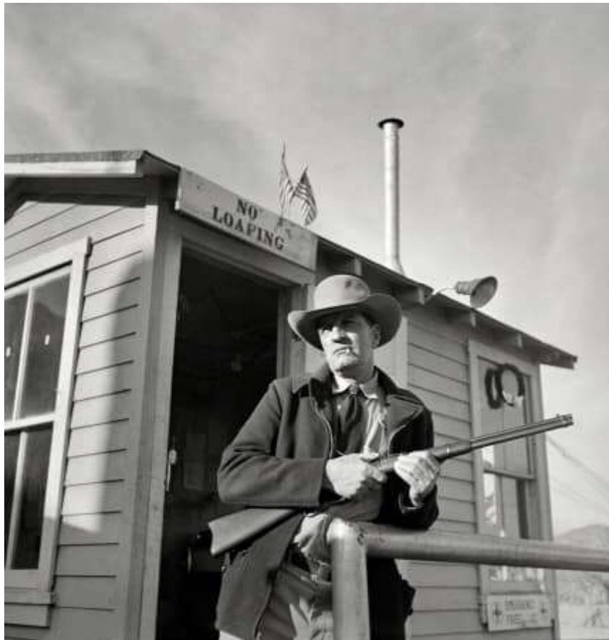
Morenci, Arizona — 1942